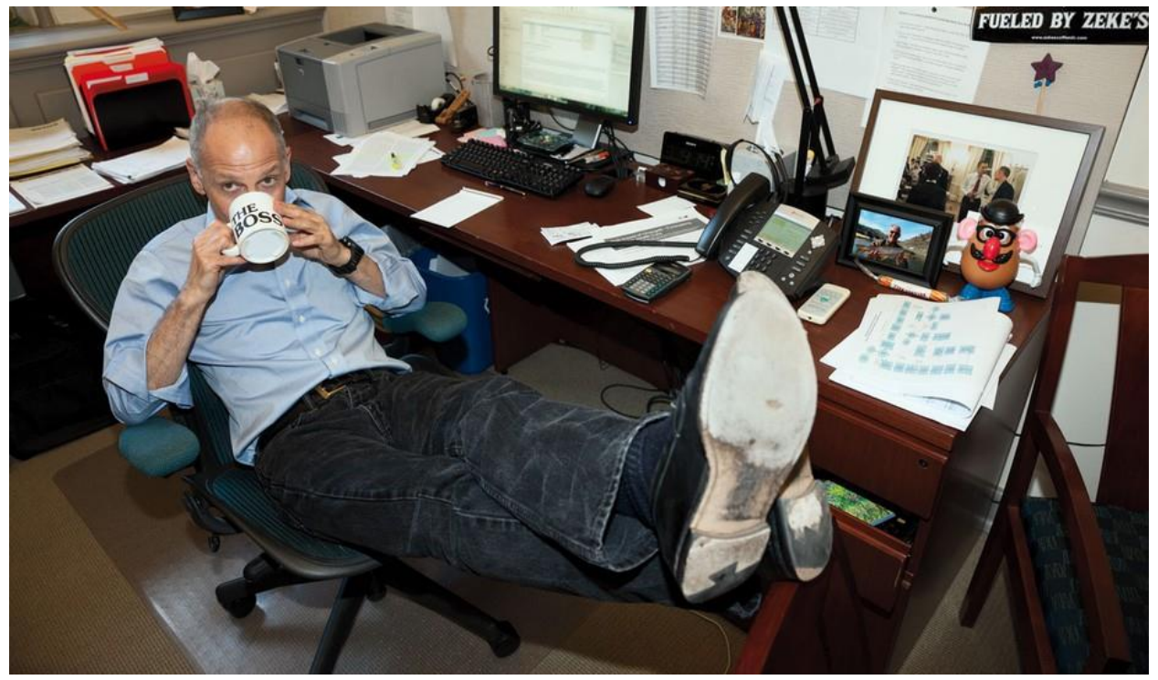
The author at his desk at the University of Pennsylvania. "I think this manic desperation to endlessly extend life is misguided and potentially destructive."